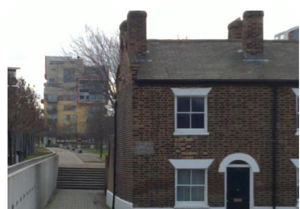
The contrast between old and new in the architecture of docklands

In 1988 11500 new houses were built and the Enterprise Zone affected post-modern architecture. In 1989 6.85 billion pounds were invested in the project in Docklands by companies and private persons. This had been done with only 706 million pounds of government grants. So the mechanism of Enterprise Zone had success. Since the beginning of revitalisation the population of the Docklands has more than doubled. Canary Wharf has become one of