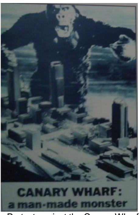
Protest against the Canary Wharf project

For this reason lots of people were not satisfied with the plans of the LDDC. To their mind the LDDC did not act on behalf of the citizens.