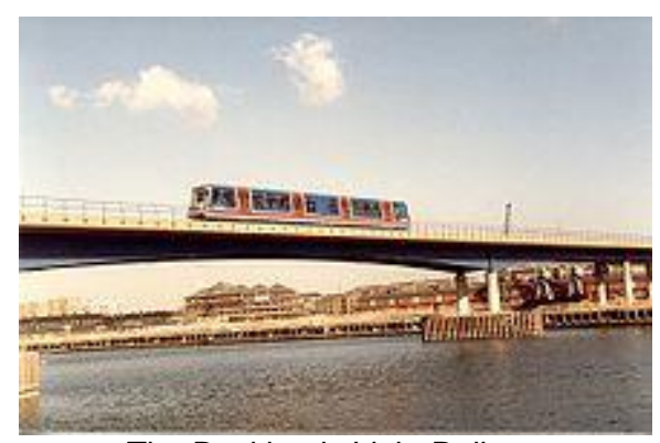
The Docklands Light Railway

The first step was the construction of the Docklands Light Railway. The LDDC needed a cheap public transport system for the former docks area to stimulate regeneration. Finally the LDDC chose a