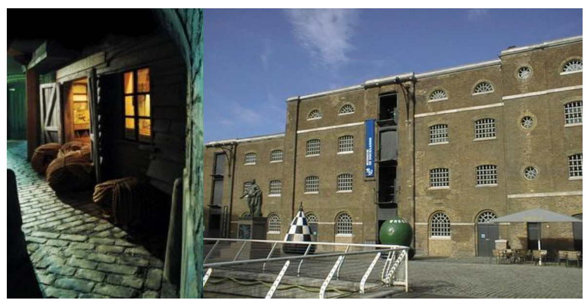
Reconstruction of an medieval warehouse and an old warehouse where the Museum of London Docklands is situated today

All kinds of seafarers could find lodgings around the Priory of St. Katherine by the Tower breweries or many other industries located on the south bank. The craftsmen of the city formed guilds to protect their interest. The members held meetings in halls of the city and they were recognized by their colourful livery. They invented Shipwrights, Coopers, Fishmongers and Merces which are all connected to the guilds and to the commerce of London's port. Because London was a Christian city the people ate fish instead of meat on Fridays. They caught eels, salmon and fresh water fish in the Thames. Herring was brought in from Rye and Great Yarmouth, was protected by smoke or salt.